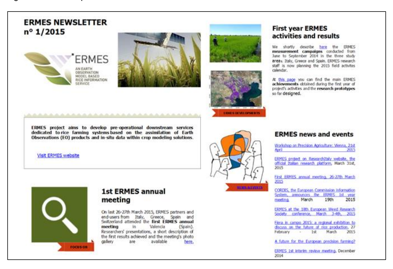
Figure 11: Main content of ERMES Newsletter number 1