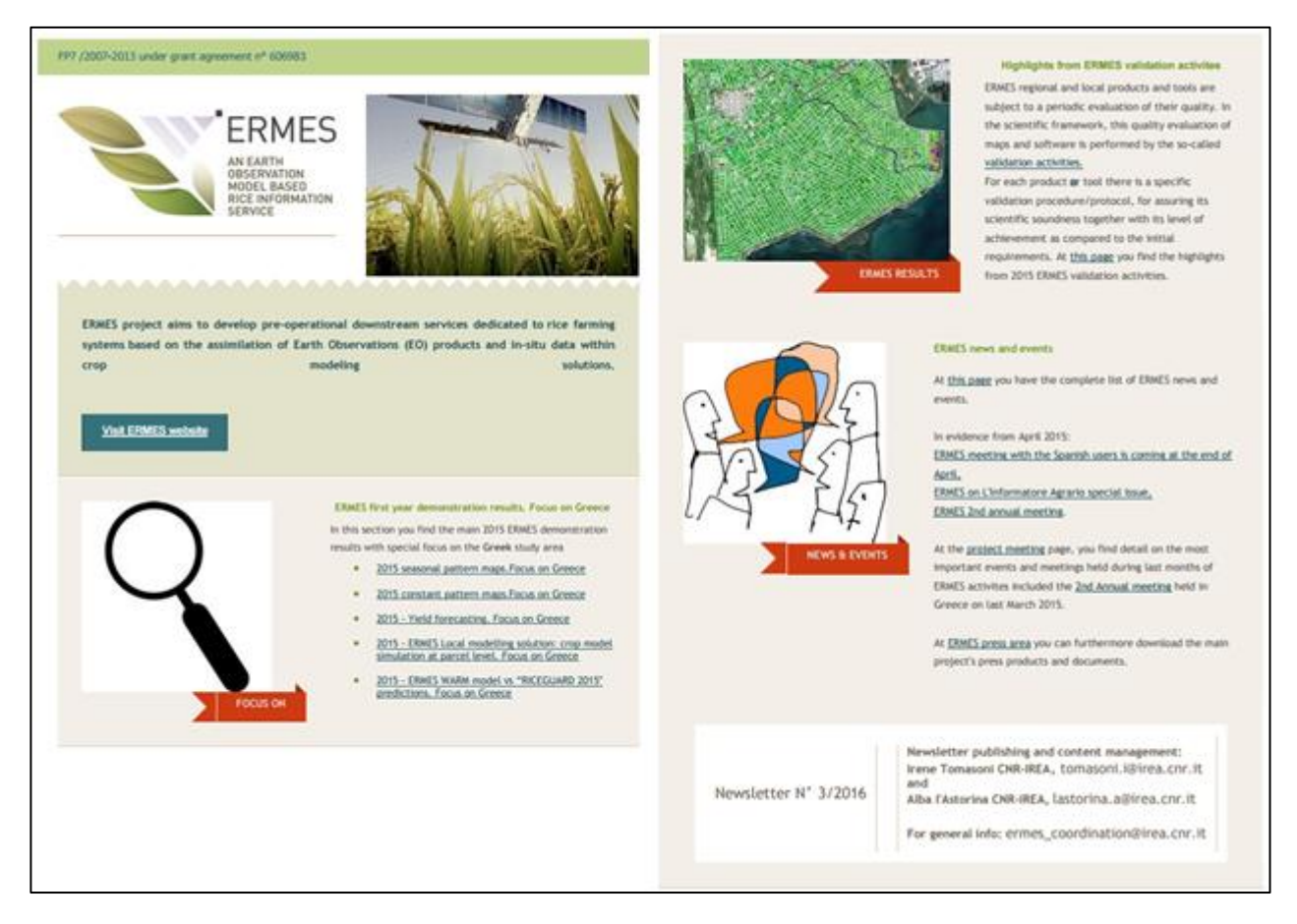
Figure 1.3: Main content of ERMES Newsletter number 3