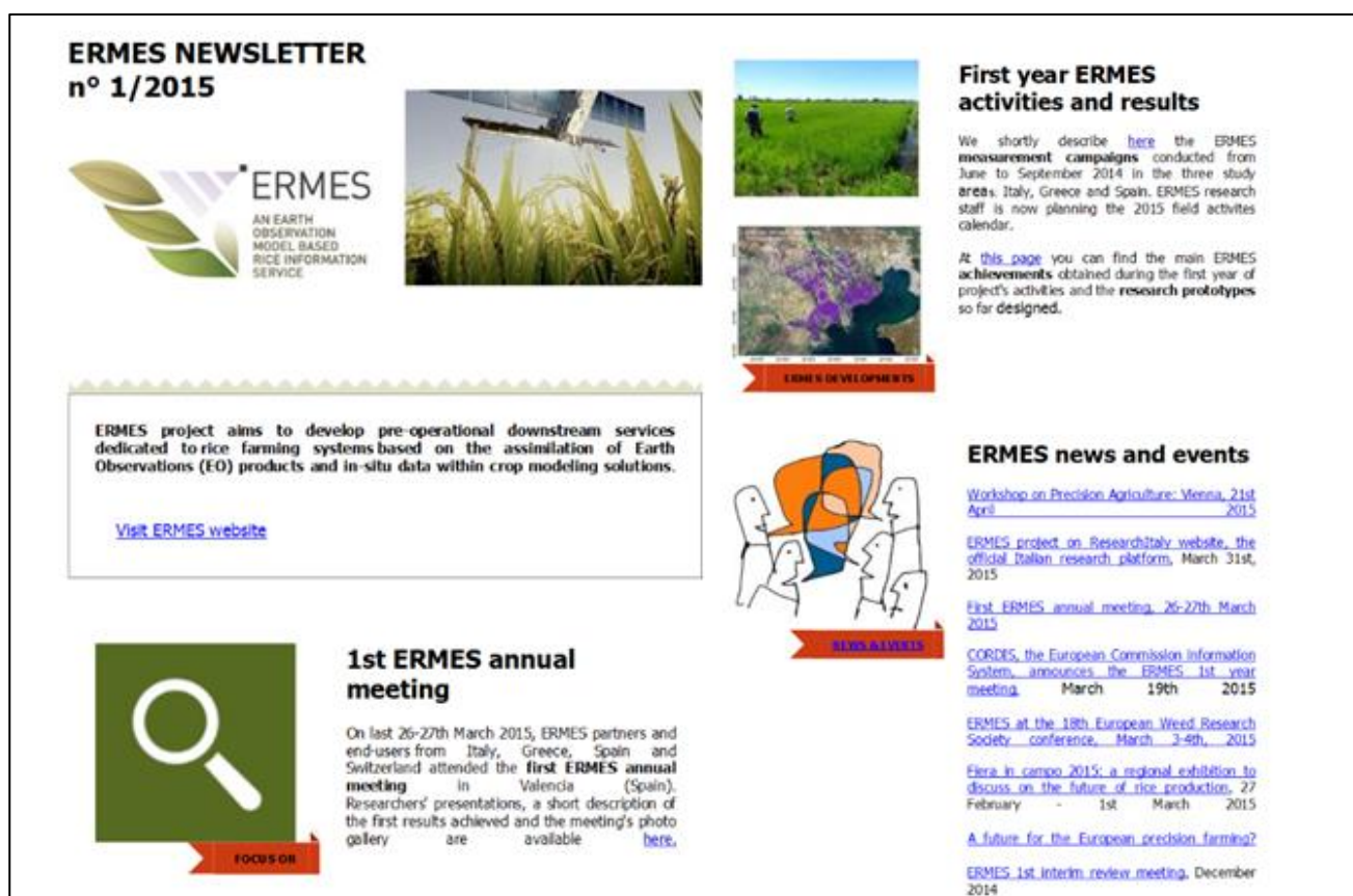
Figure 11: Main content of ERMES Newsletter number 1

Figure 1.1 shows a preview of Newsletter number 1.