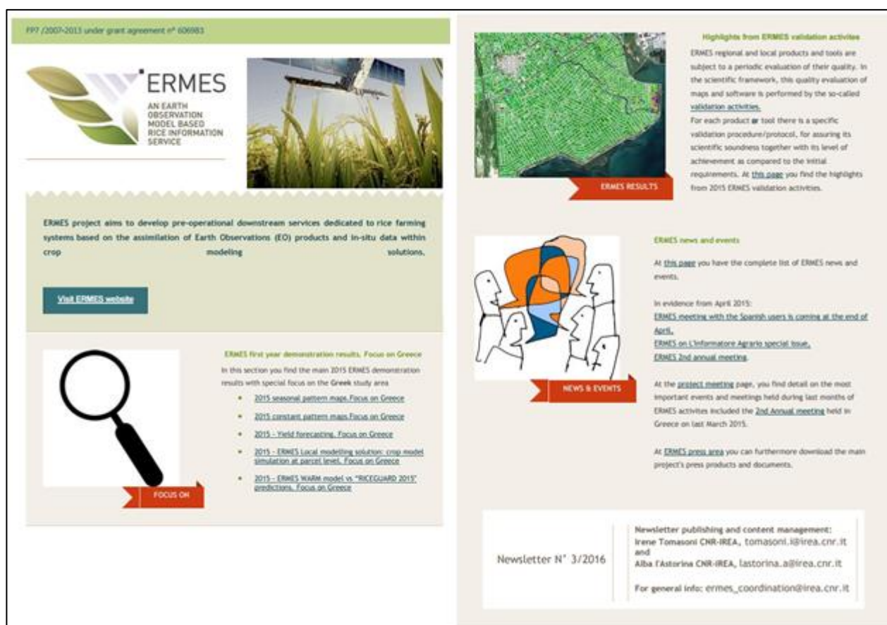
Figure 1.3: Main content of ERMES Newsletter number 3

Figure 1.3 shows a preview of Newsletter number 3.