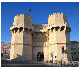
Figure 3. Serrano Towers, near the Restaurant "Blanqueries" (social dinner).