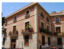
Colegio Mayor RECTOR PESET Plaza Horno San Nicolás, 4 46001-Valencia http://www.uv.es/cmripeset/cas/index.htm

The First Annual ERMES Meeting is scheduled in two days and will take place in Valencia (Spain) at the Hall of Residence Rector Peset ( Colegio Mayor Rector Peset ), which belongs to the Universitat de València .